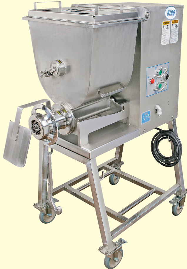
MINI-22 (Mini-Automatic Feed)

So break away from the daily grind and keep your ground meat as fresh as possible with the BIRO Model MINI-22.