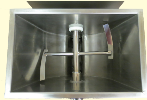
PADDLE SHOWN INSTALLED IN HOPPER