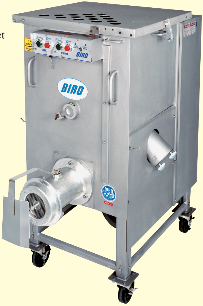
MODEL AFMG-52 AUTO-FEED MIXER-GRINDER Shown with Optional (NC) Right Hand 35 ° Hopper Feed Inlet