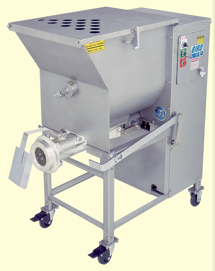
Shown with optional adjustable legs with casters

The BIRO AFMG-24 Mixer Grinder is an ideal mixer grinder for today's compact supermarket meatroom. It's 5 hp/3.7 kW (7.5 hp/5.6 kW optional) auger motor, 145 lbs. (66 kg) hopper, and size 32 head can give you an output of up to 68 lbs. (31 kg) per minute for the productivity you need. For even more productivity, your AFMG-24 can come with an optional meat lug holder (see reverse) and an optional electric or pneumatic footswitch. The heavy duty stainless steel hopper, frame, and legs will stand up to years of daily washdown and still resist corrosion, so your mixer grinder lasts longer, and you get a better return on your investment. Of course, it's built with the superior engineering you expect from BIRO.