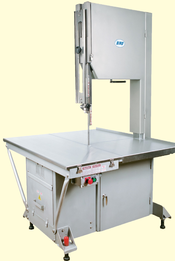
RIGHT TO LEFT FEED CONFIGURATION (OPTIONAL STATIONARY FRONT AND REAR TABLES)