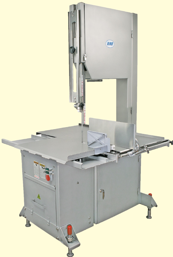
STANDARD RIGHT TO LEFT FEED CONFIGURATION (FRONT MOVING CARRIAGE AND STATIONARY REAR TABLE)

The 5 HP (3 Kw) motor provides all the power you need to break pork, lamb, veal, or beef all day in a high volume production operation. Heavy duty, stainless steel construction helps the Model 55 hold up under the harshest conditions with minimum maintenance. With the standard front moving carriage and meat gauge plate and 20" H (508mm) by 21" D (533mm) cutting clearance, you can use the same saw to produce retail cuts or split loins and break quarters, which makes the Model 55 unmatched for versatility. Superior BIRO engineering means you'll have a saw that's built to last. Over the life of the saw, you'll get more for your money. As with all BIRO products, if you need a particular modification to fit your application let us know. We'll try to build it for you - something only BIRO does.