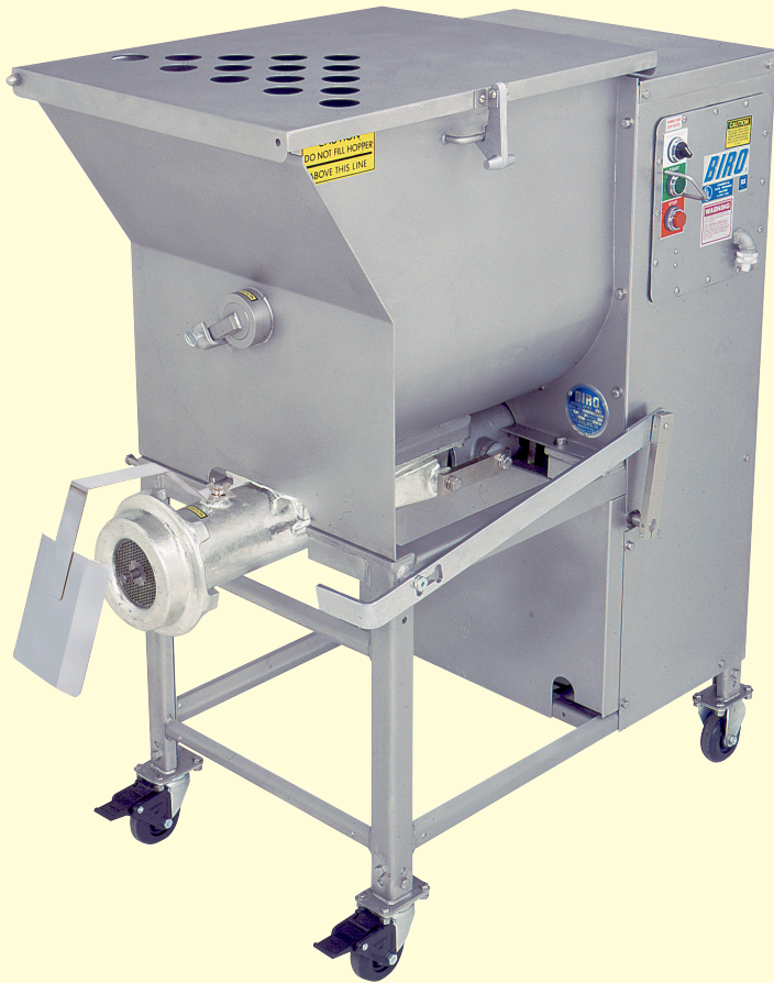
Shown with optional adjustable legs with casters

The BIRO AFMG-24 Mixer Grinder is an ideal mixer grinder for today's compact supermarket meatroom. It's 5 hp/3.7 kW (7.5 hp/5.6 kW optional) auger motor, 145 lbs. (66 kg) hopper, and size 32 head can give you an output of up to 68 lbs. (31 kg) per minute for the productivity you need. For even more productivity, your AFMG-24 can come with an optional meat lug holder (see reverse) and an optional electric or pneumatic footswitch. The heavy duty stainless steel hopper, frame, and legs will stand up to years of daily washdown and still resist corrosion, so your mixer grinder lasts longer, and you get a better return on your investment. Of course, it's built with the superior engineering you expect from BIRO.